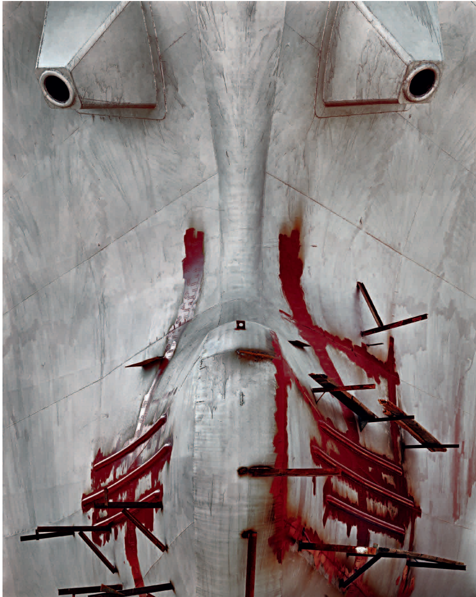
Shipyard #14, Qili Port Zhejiang Province, China, 2005