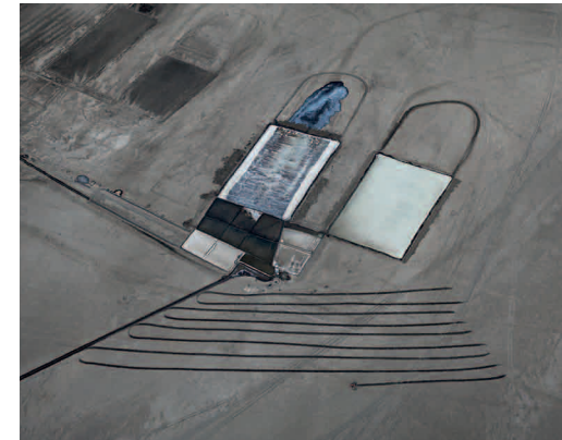
Salt Pan #5, Little Rann of Kutch Gujarat, India, 2016