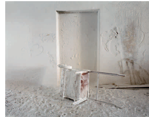
Saltworks #5, Sambar Salt Flats Rajasthan, India, 2000

Mr. Burtynsky's distinctions include the TED Prize, The Outreach award at the Rencontres d'Arles, The Flying Elephant Fellowship, Applied Arts Magazine book award(s), and the Roloff Beny Book award. In 2006 he was awarded the title of Officer of the Order of Canada and holds four honorary doctorate degrees, with a fifth to be awarded in 2013.