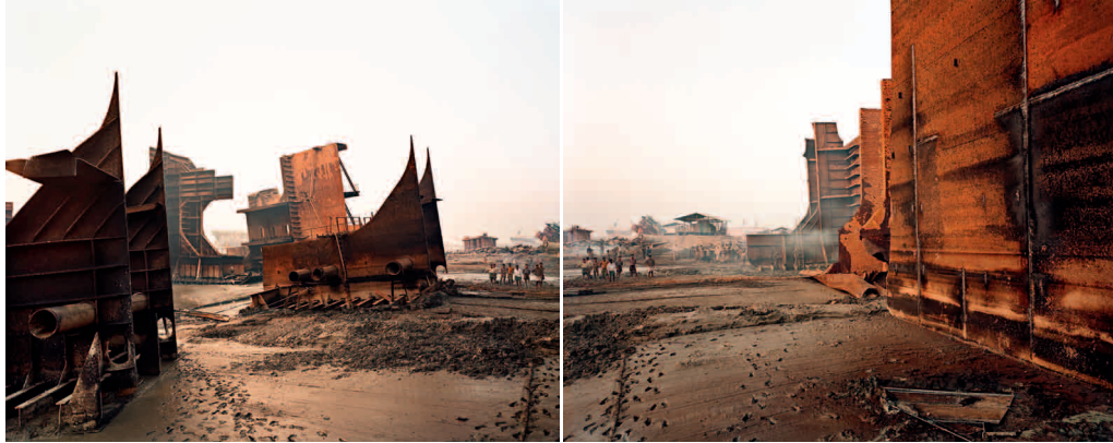
Shipbreaking #9, Diptych, Chittagong Bangladesh, 2000

Edward Burtynsky is known as one of Canada's most respected photographers. His remarkable photographic depictions of global industrial landscapes are included in the collections of over fifty major museums around the world, including the National Gallery of Canada, the Museum of Modern Art and the Guggenheim Museum in New York, the Reina Sofia Museum, Madrid, and the Los Angeles County Museum of Art in California.