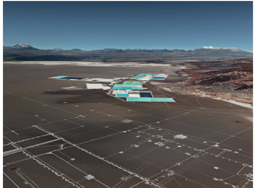
Lithium Mines #2 Salt Flats, Atacama Desert, Chile, 2017

Edward Burtynsky is known as one of Canada's most respected photographers. His remarkable photographic depictions of global industrial landscapes are included in the collections of over fifty major museums around the world, including the National Gallery of Canada, the Museum of Modern Art and the Guggenheim Museum in New York, the Reina Sofia Museum, Madrid, and the Los Angeles County Museum of Art in California.