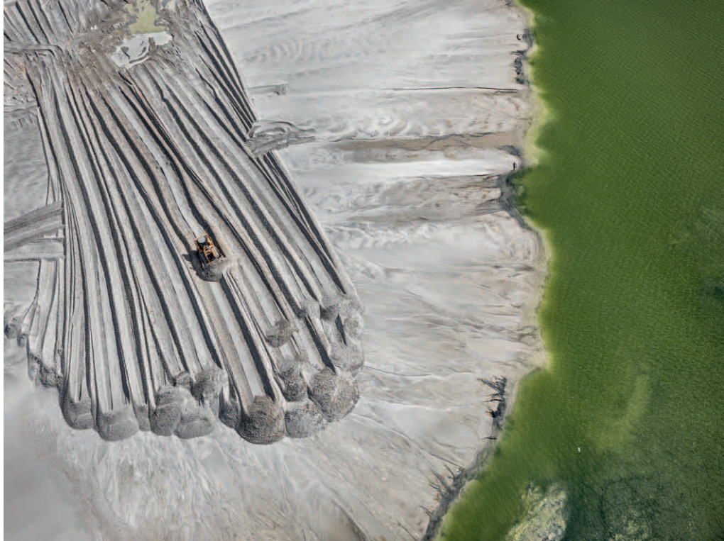
Phosphor Tailings Pond #4 Near Lakeland, Florida, USA, 2012