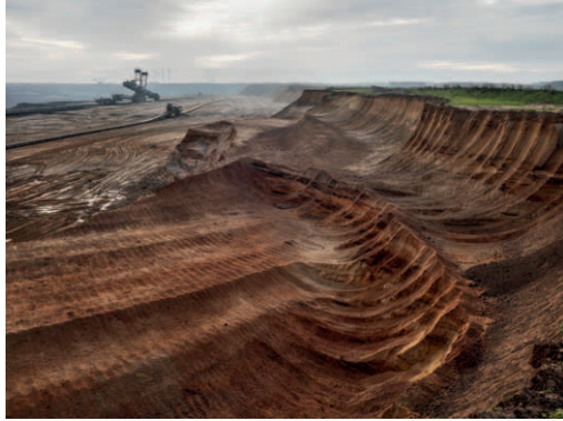
Coal Mine #1 North Rhine, Westphalia, Germany, 2015