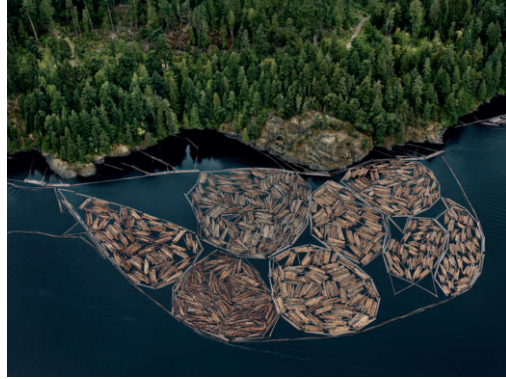
Log Booms #1 Vancouver Island, British Columbia, Canada, 2016

Burtynsky was born in 1955 of Ukrainian heritage in St. Catharines, Ontario. He received his BAA in Photography/ Media Studies from Ryerson University in 1982. He links his early exposure to the sites and images of the General Motors plant in his hometown to the development of his photographic work. His imagery explores the intricate link between industry and nature, combining the raw elements of mining, quarrying, manufacturing, shipping, oil production and recycling into eloquent, highly expressive visions that find beauty and humanity in the most unlikely of places. In 1985, Burtynsky also founded Toronto Image Works, a darkroom rental facility, custom photo laboratory, digital imaging and new media computer training centre catering to all levels of Toronto's art community.