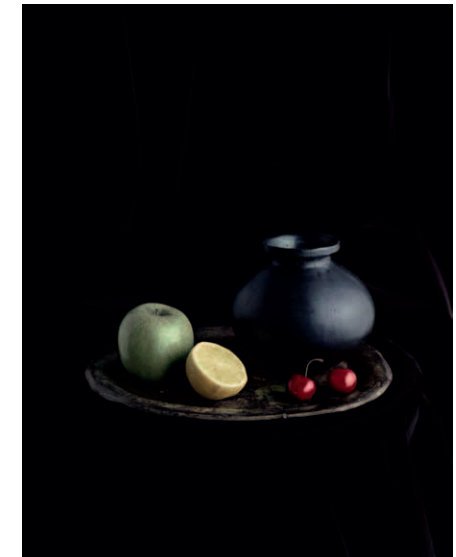
Oaxaka-Krug mit Kirschen (Stilleben Nr.4) 1997