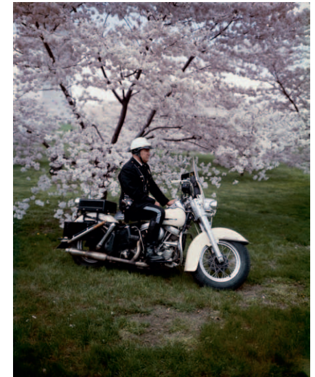
Frühling Washington, 1965