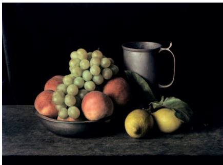
Zinnkrug mit Trauben (Stilleben Nr.7) 1997