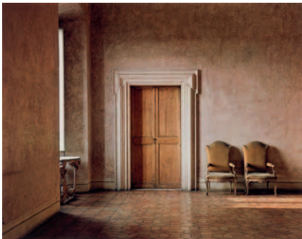
Villa Medici, Empfangshalle Rom, 1982