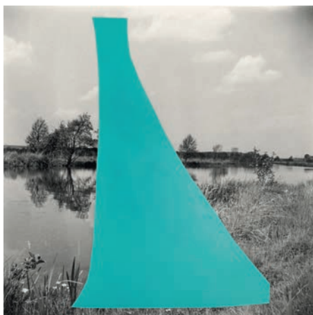
ohne Titel (Spiegelung). 2021