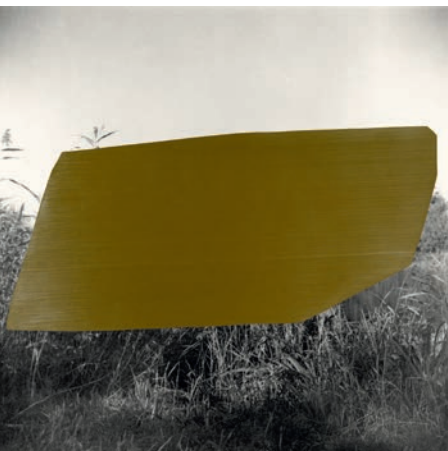
ohne Titel (Warnow). 2021