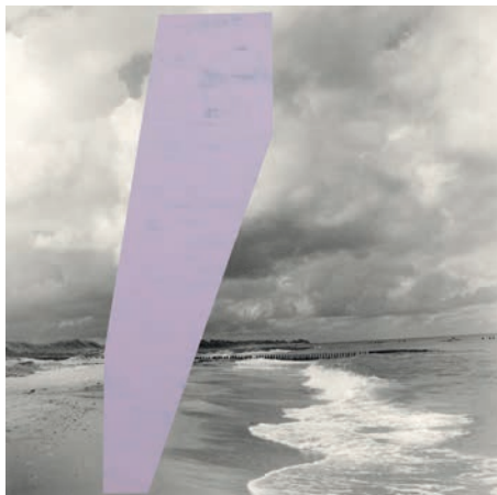
ohne Titel (Strand). 2021