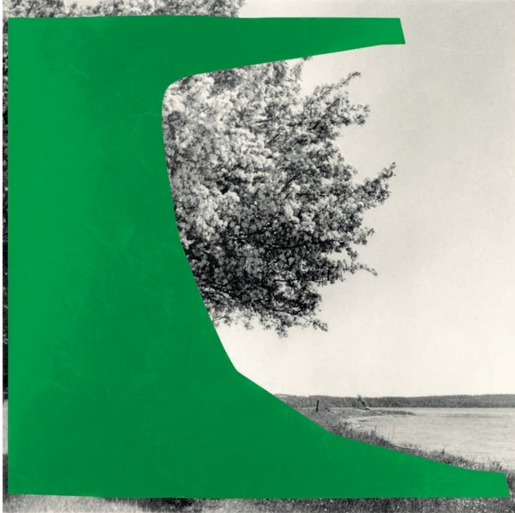
ohne Titel (Baum), 2021