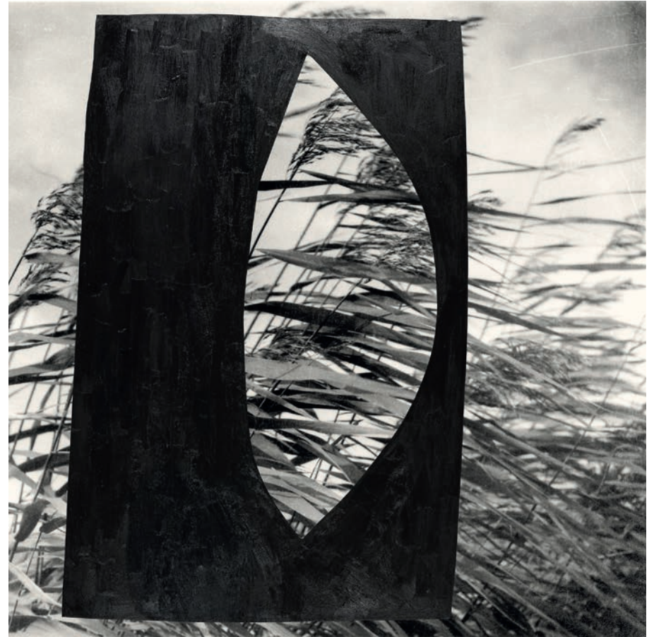
ohne Titel (Schilf), 2021