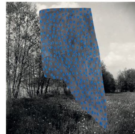
ohne Titel (Blumenwiese). 2021