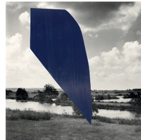
ohne Titel (Fluss). 2021