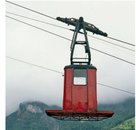
Grafenort. Engelberg, 1993

Plateau der Menschheit. Biennale di Venezia, Arsenale, Venezia/I.