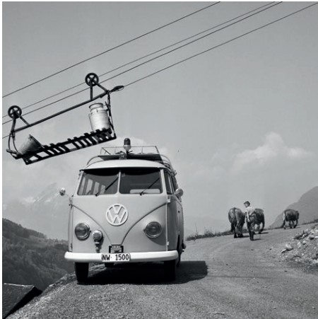
Büren. Oberdorf, 1966