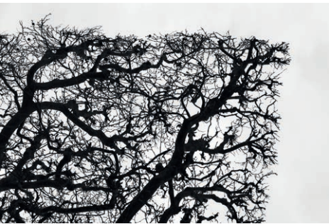
Untitled (Paris #02). 2024, Archival pigment print