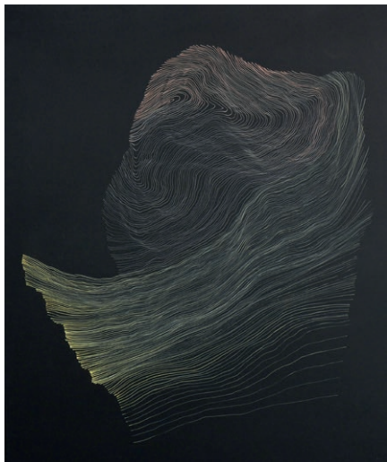
Untitled. 2024, Acrylic on canvas