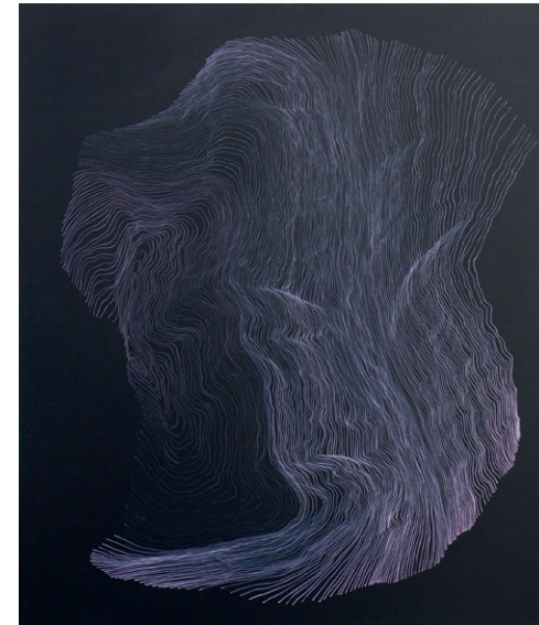
Untitled. Acrylic on canvas, 2024