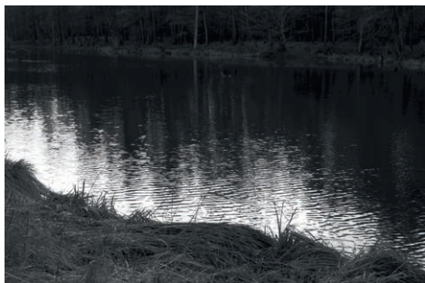
Untitled (Garbatka #02). 2023, Archival pigment print