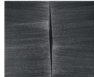
Untitled. 2021, Acrylic on canvas

14th Eastern Show-Room of Art. Graphic Art, Lublin, PL