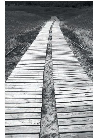
Untitled. Duna, 2023, Archival pigment print